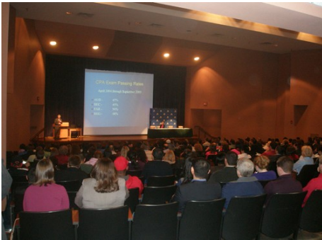
250 CPA CANDIDATES ATTENDED THE MEETING AT UTA, JOINTLY SPONSORED WITH FW TSCPA